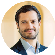
Prins Carl Philip